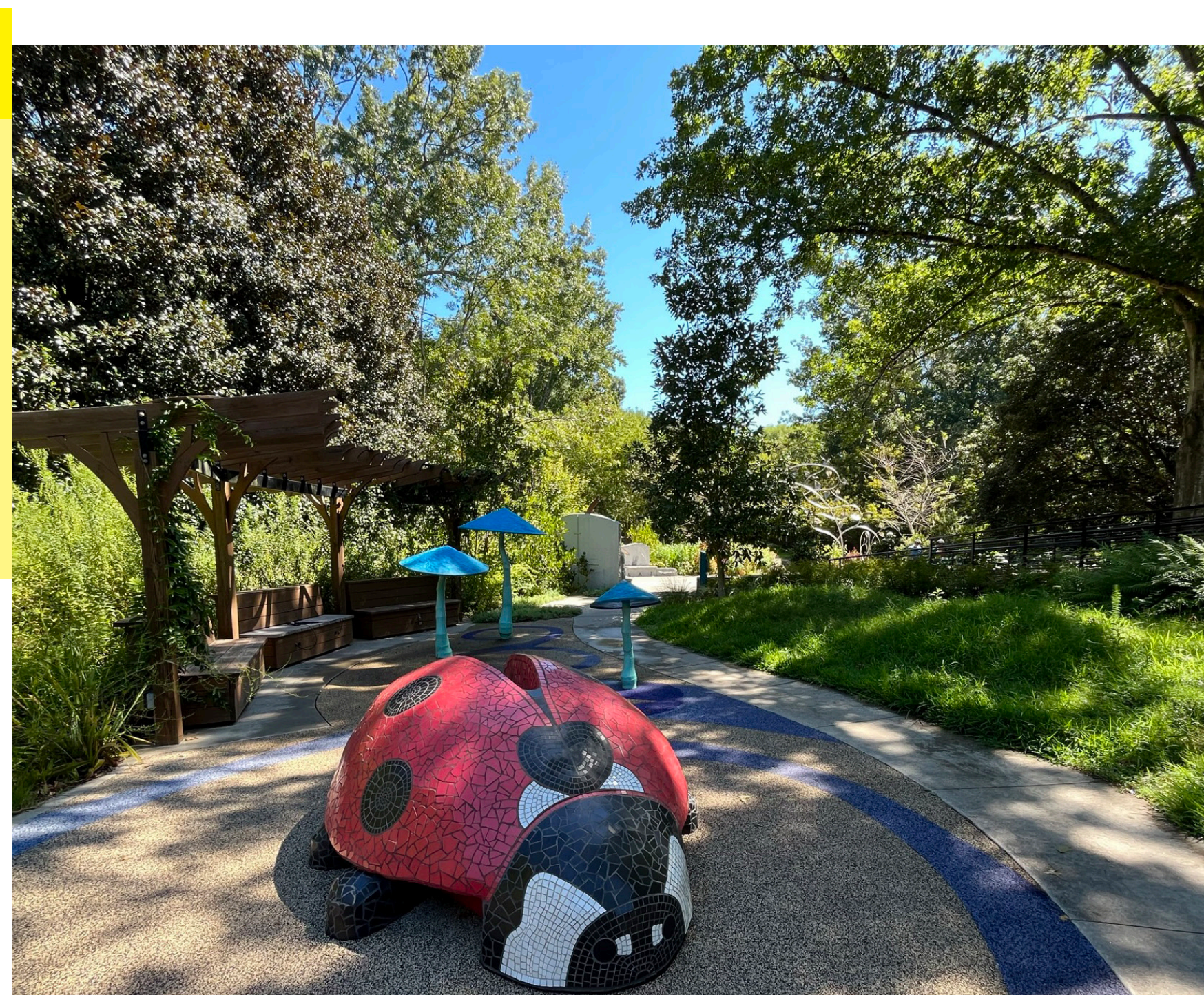
Public Art + Play Areas