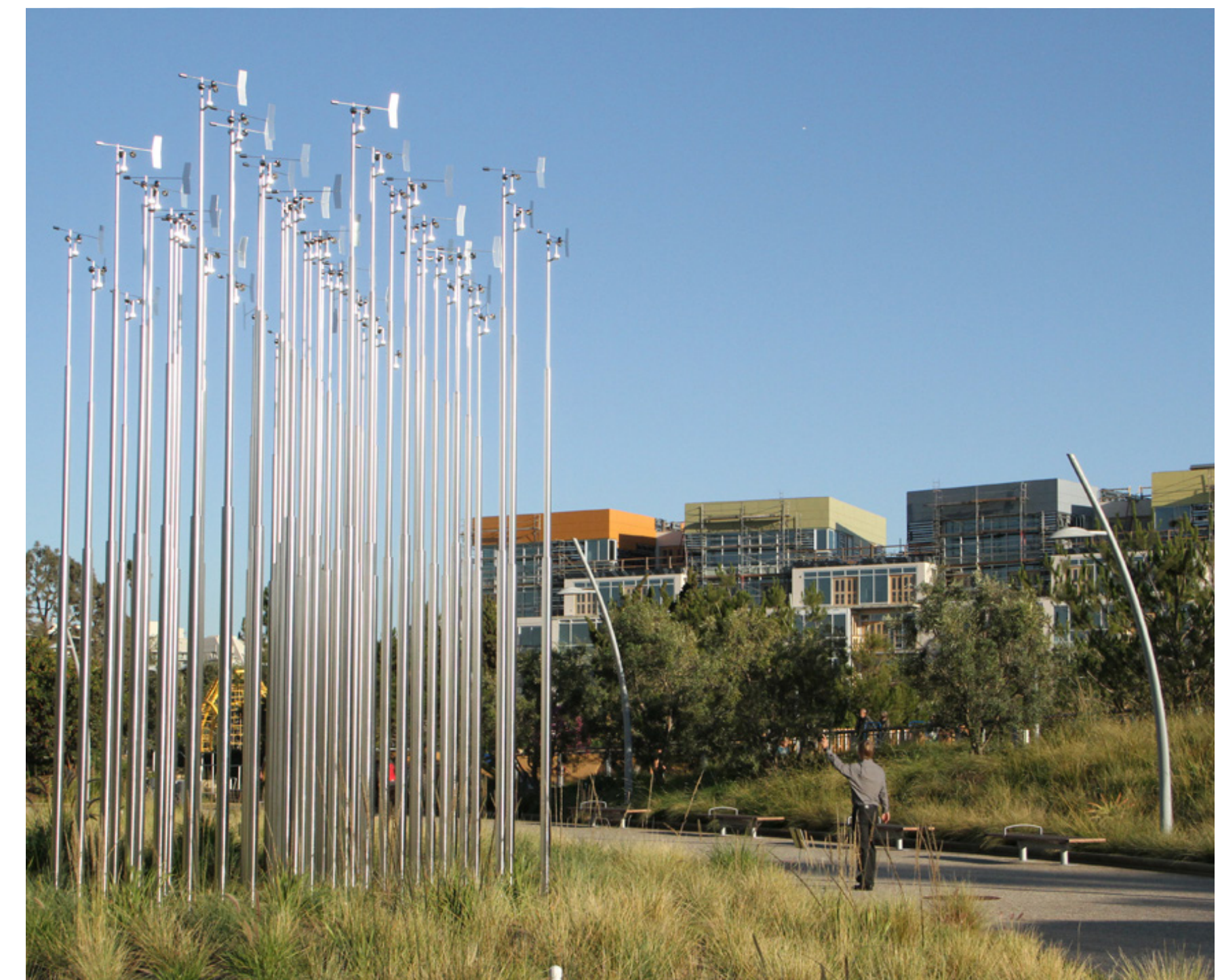
Public Art + Sculpture