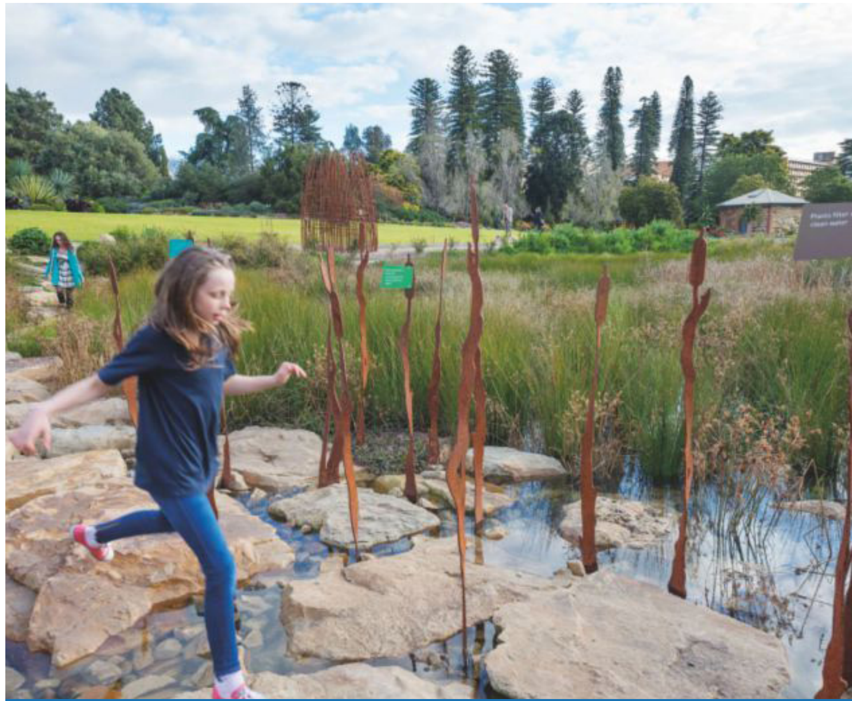
Native Plant + Wildlife Communities

Placemaking strengthens connections between people and our shared spaces. It draws on local inspiration for design, creates opportunities for activity and interaction, and showcases the community identity and values. Quirks and creativity are welcome. At its best, placemaking is a collaborative, ongoing community effort to create special moments that make a place shine.