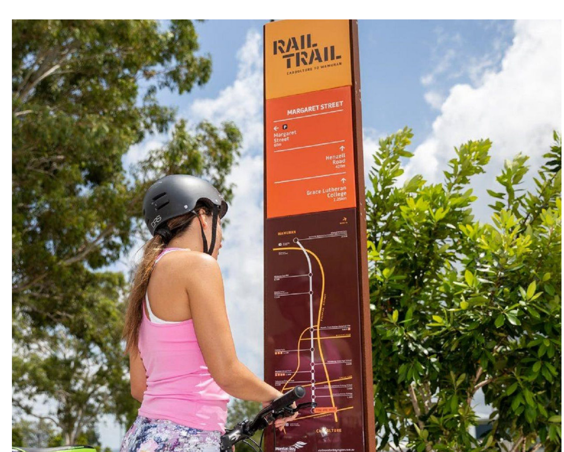
Wayfinding + Signage